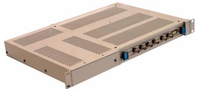
VM600 slimline rack (ABE056) shown housing an MPC4 card